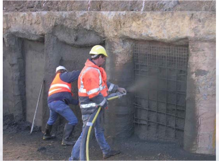
Placement & Cut back to form required Profile