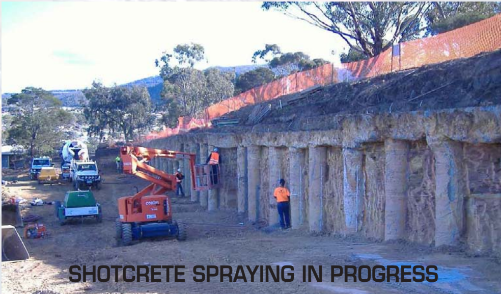
SHOTCRETE SPRAYING IN PROGRESS

Since 1990 Maintenance Systems Pty Ltd has continued to develop and utilize World Leading Technologies associated primarily with concrete and masonry repair, specialized coatings, industrial flooring systems and waterproofing & grouting