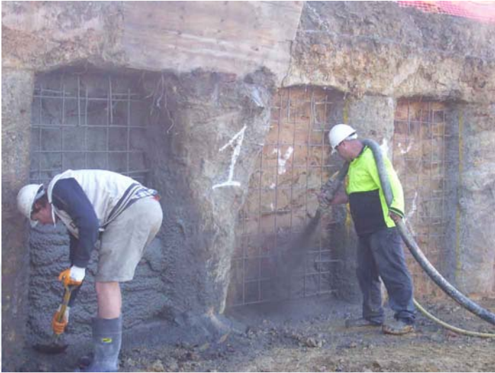
Initial placement of shotcrete over reinforcement steel

Earth stabilisation by utilising reinforced sprayed shotcrete with steel trowel finish