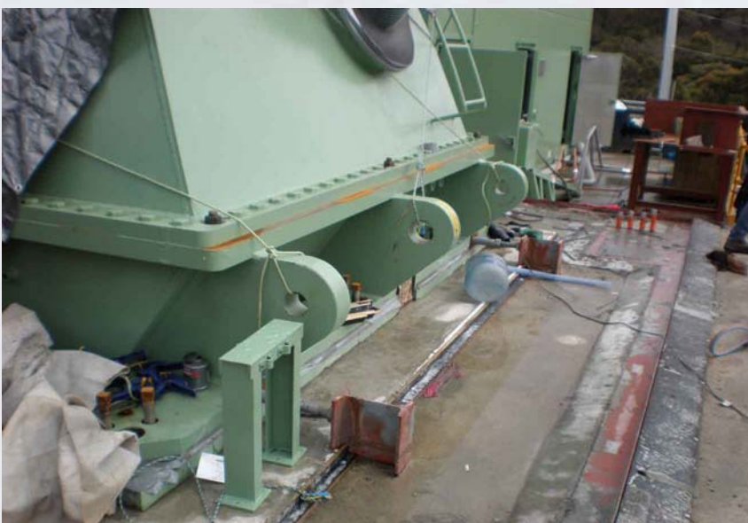
Cementitious Grouting to Mitsubishi Steam Turbines These machines were on elevated platforms making access difficult and pumping necessary.