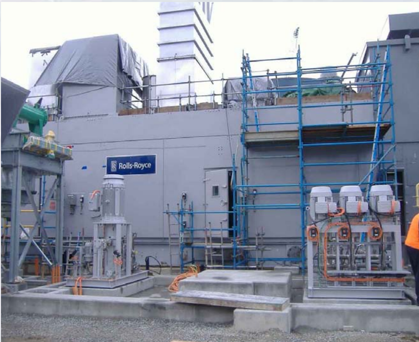
Generator Set & Gas Turbine Sloping Base 80mm thick, 5 metre wide x 24 metre long required placement of 4100 litre epoxy grout