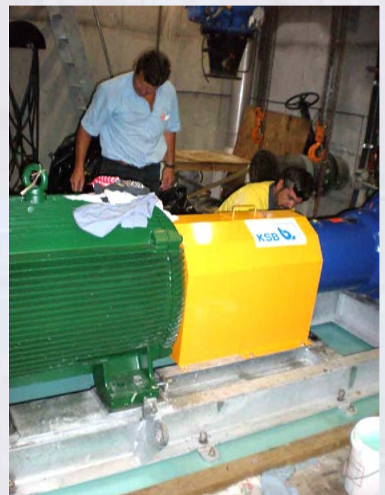
Inspection of Epoxy Grout after placement under new waste water pump, Hobart