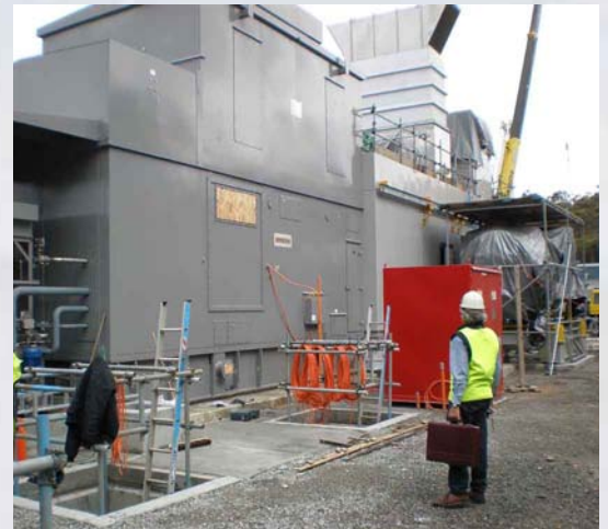
Project completed and a sigh of relief at the huge Epoxy Placement in a short time frame